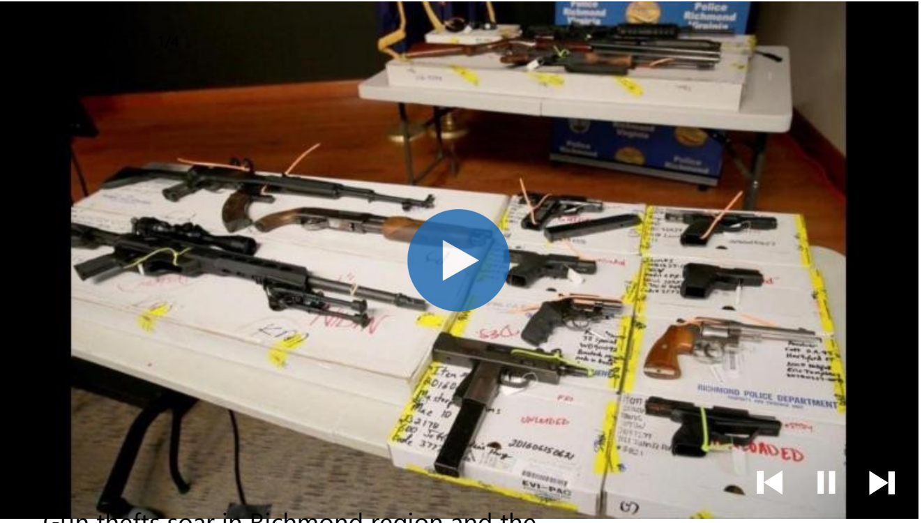
Gun thefts soar in Richmond region and the consequences can be devastating

The report found that Virginia rates were similar to the national average rates for many of the valuemeasuring metrics. For example, 14 percent of patients reported fair or poor health and 88 percent of patients reported receiving information on home recovery.